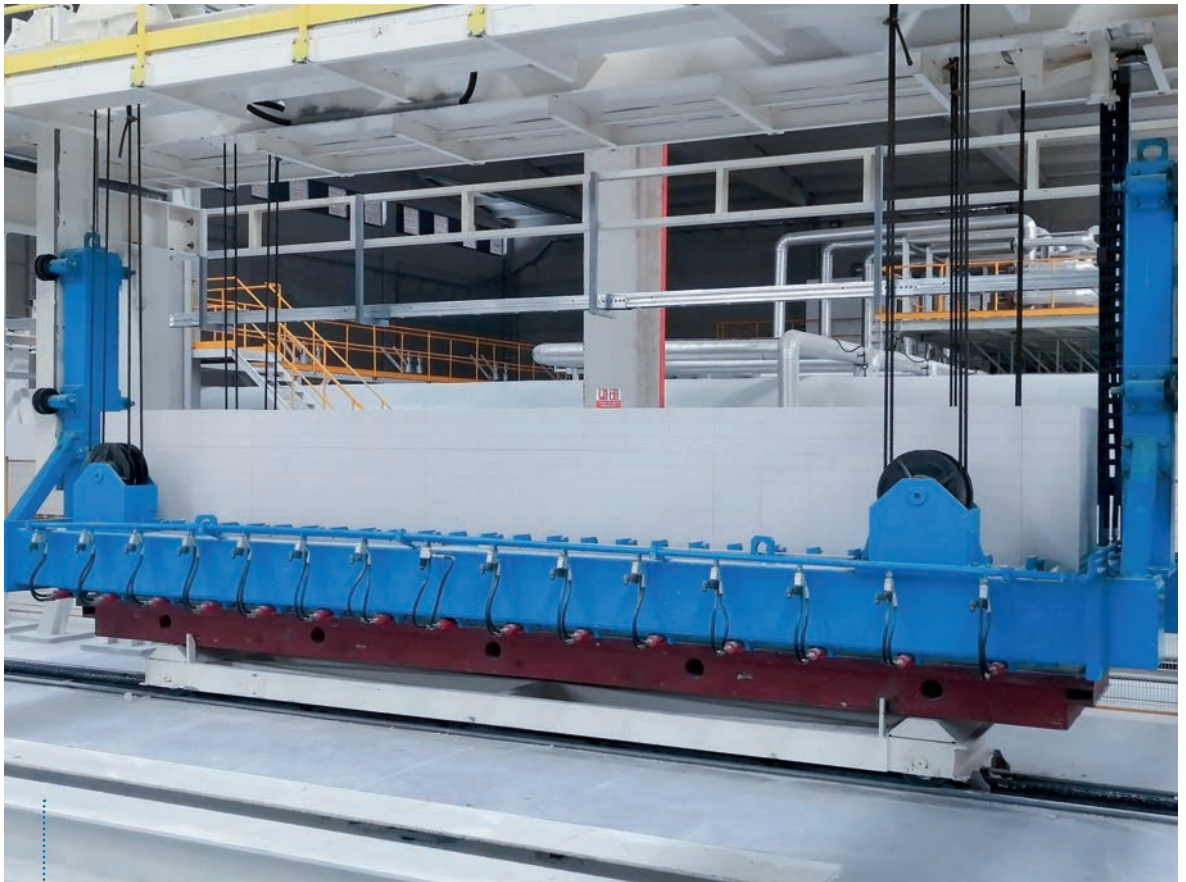
Packing section - clamping machine

productivity. Considering that the customer could not come to China for inspection and ex-factory commissioning, the Keda team facilitated the process of commissioning through online conferences and recorded videos.