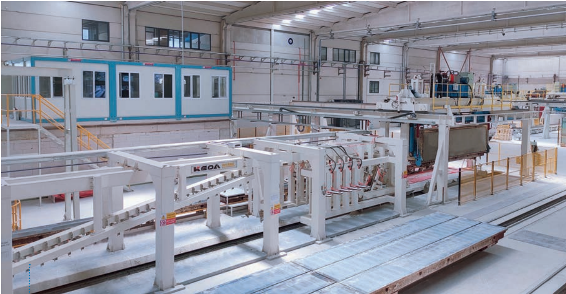
The cutting system runs fully automatically