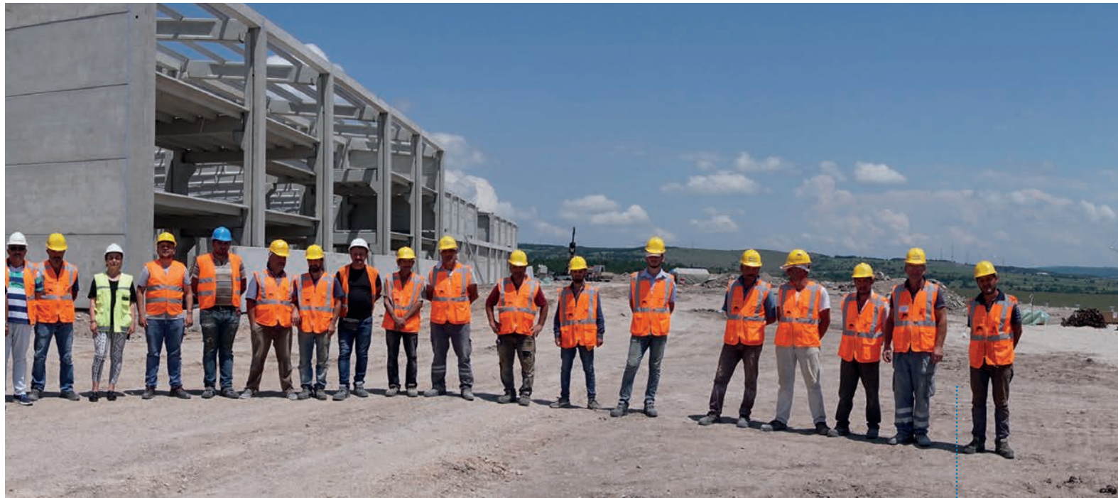
The local civil construction team